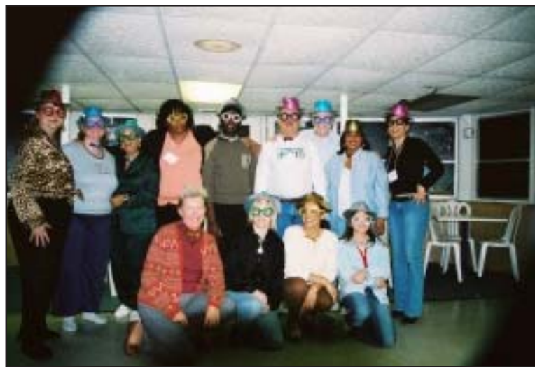
Lip Sync Participants